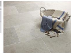
Blenheim Brushed Grey Limestone Floor Finish Throughout