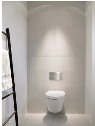
*Please note some imagery has been sourced through Pinterest or Houzz