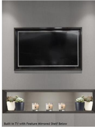
Built in TV with Feature Mirrored Shelf Below