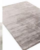
Arte Silk Rug to Living Area