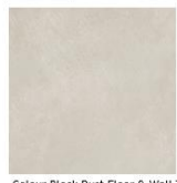
Colour Block Dust Floor & Wall Tile