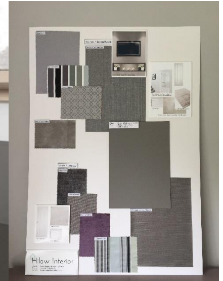
On Site Reference