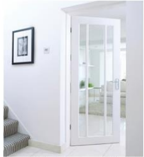
Glass / White Double Doors Leading in to the Kitchen / Living Room from Hallway