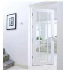
Glass / White Double Doors Leading in to the Kitchen / Living Room from Hallway