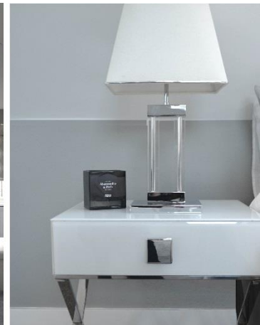
Dorma House Project, Chislehurst BR7 Residential: 3 Bedroom Bungalow